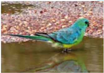
Red-rumped Parrot (left), Mallee Ringneck (upper right) and Blue Bonnet (lower right)