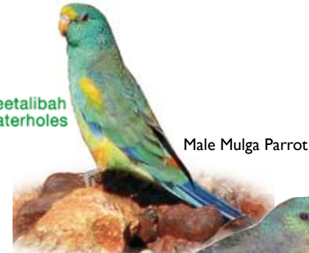
Male Mulga Parrot