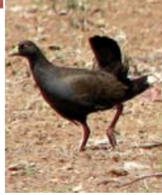
Black-winged Stilt (top) and Black-tailed Native Hen.

Site 2 - Quandong Enclosure, Castlereagh Highway (Grid ref. 595094mE, 6736153mN)