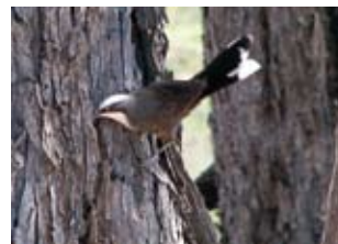
Grey-crowned Babbler (Vulnerable)