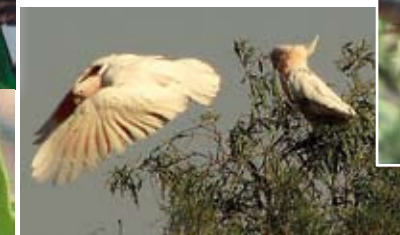
Major Mitchell Cockatoos